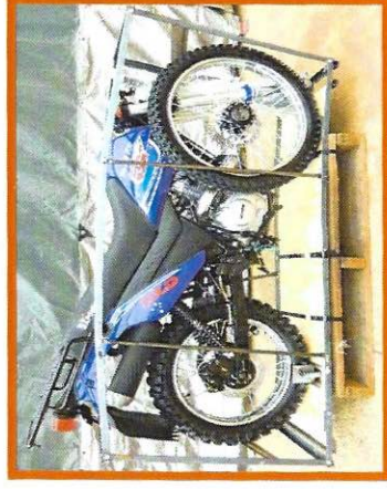
* Boxed for Delivery (90% Assembled)